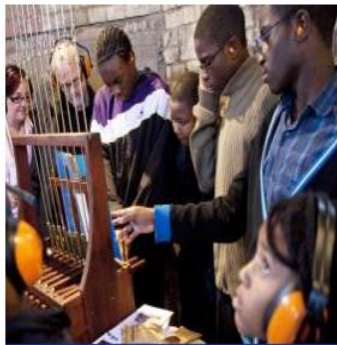
Sharing Heritage Grants from £3,000 to £10,000

Which programme suits your idea? We have a number of different grant programmes, funding all kinds of heritage projects.