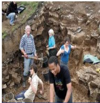
Our Heritage Grants from £10,000 to £100,000