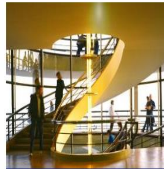
Heritage Grants Grants of over £100,000